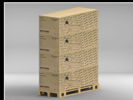
STORAGE Built to reduce at the minimum the encumbrance during the carriage and above all the storage space.