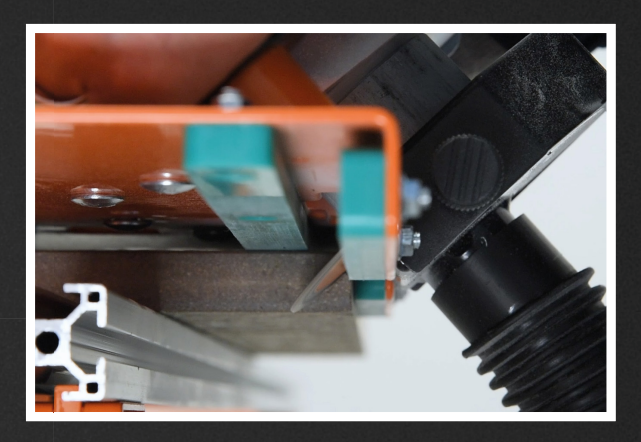
Adjustable bevel depth, with maximum cutting height of 21 mm, disc cover with dust extraction.