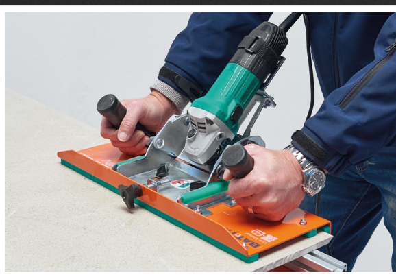
Strong structure, precise and fluid sliding with polyethylene pads, practical and comfortable handles on which to apply the pressure necessary for advancement.