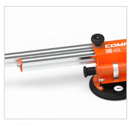
TELESCOPIC BARS Advanced mechanism for telescopic bars.

PROFESSIONAL SUCTION CUP High quality professional Suction Cups with vacuum indicator. Resistant rubber with special design for perfect adherence on rough surfaces.