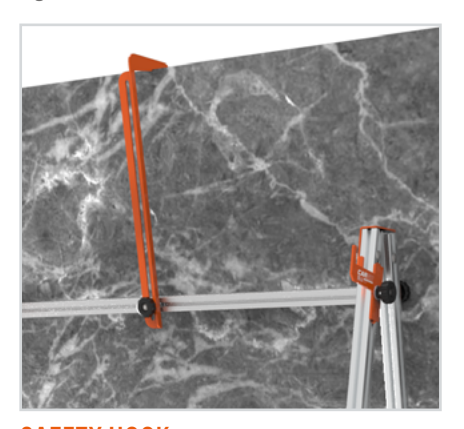
SAFETY HOOK Cargo allows you to move one or more slabs using the safety hook to avoid accidental unhooking.

PIVOTING WHEELS It is equipped with 4 swivel wheels with brakes, to allow easy movement of large format slabs.