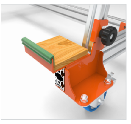
SUPPORT WITH VIBRATION REDUCTION It has specific wooden supports to better cushion the vibrations caused by uneven surfaces.

The structure is in aluminium to get rigidity. Section is 30x30mm, specifically designed for a perfect balance between large format tile and high effective material resistance.