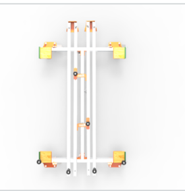
EASY TO TRANSPORT Cargo can be easily reduced for easy transportation.