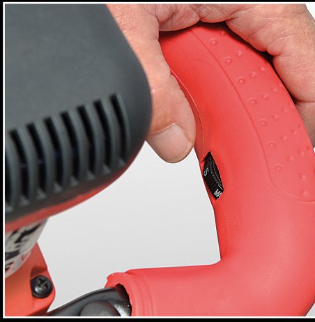
Electronic rotation speed variator up to 6 levels